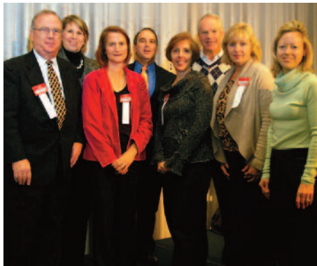
The AMA Past Presidents were recognized at the November 19 luncheon including: